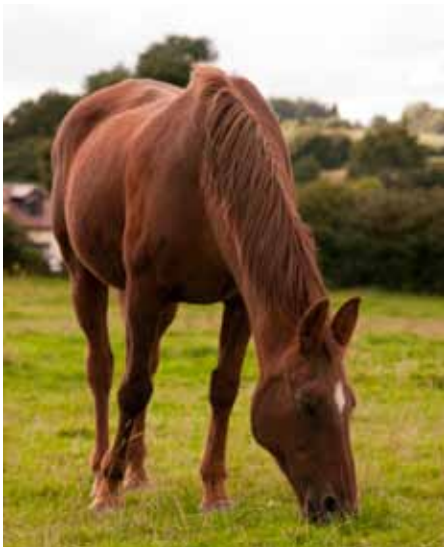
The Beautiful Springy