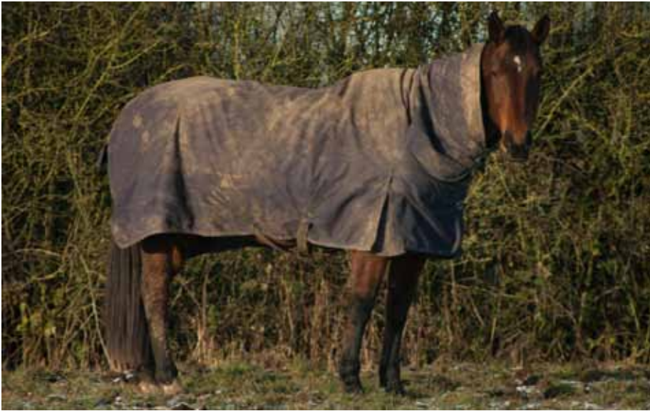
Illy-Anne herd leader of the French Four.