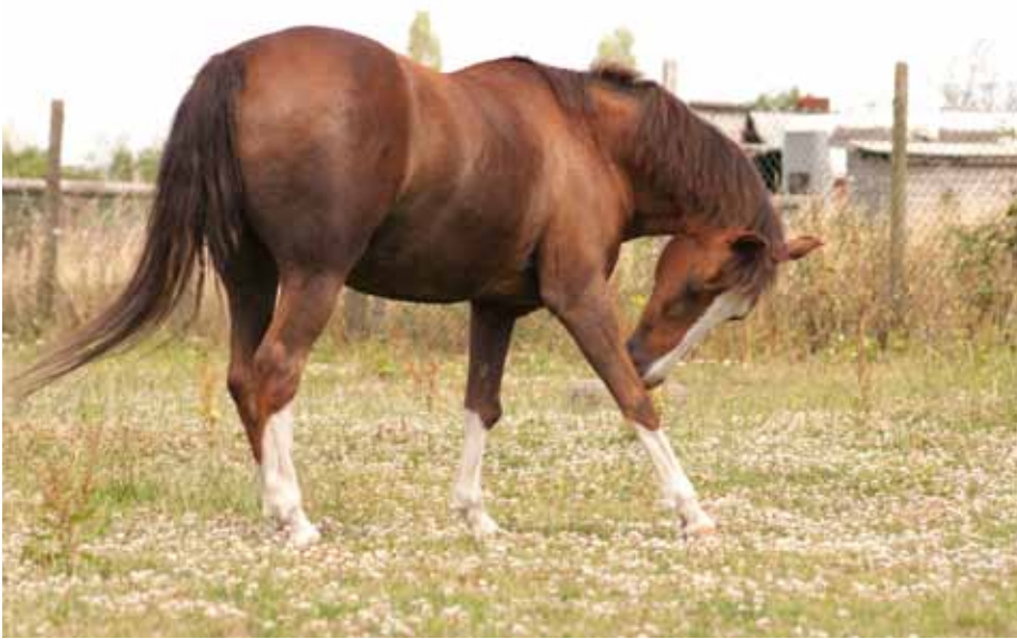
Cottie calm on arrival.