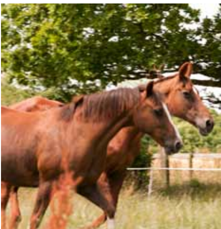
Cottie and Spring new best freinds.