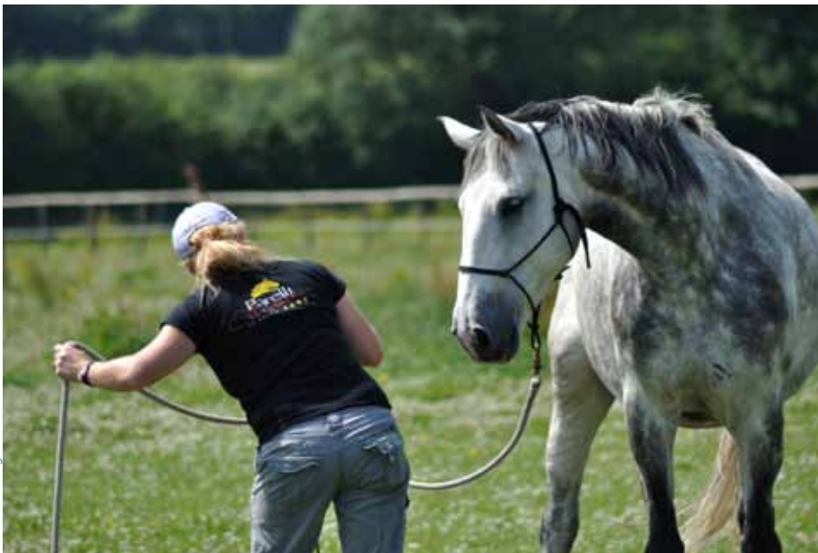
Bailey enjoying his Natural Horsemanship.